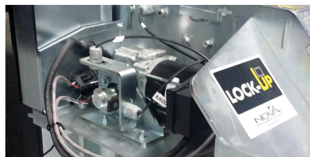
Sealed magnetic proximity sensors with direct drive gear motor