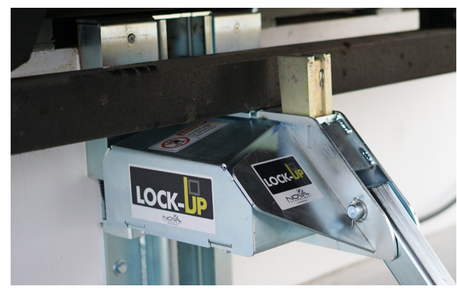
BEST RESTRAINING FORCE: 38,000-POUNDS