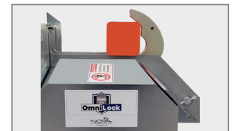
Secures Stanard RIG bars