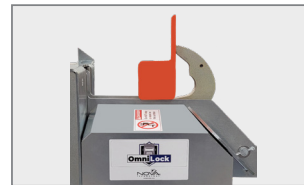
Secures RIG bars with plates, including Intermodal chassis