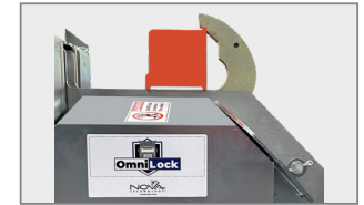
Secures 4 1/2" Reinforced RIG bars