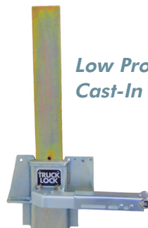
Low Profile Cast-In Style