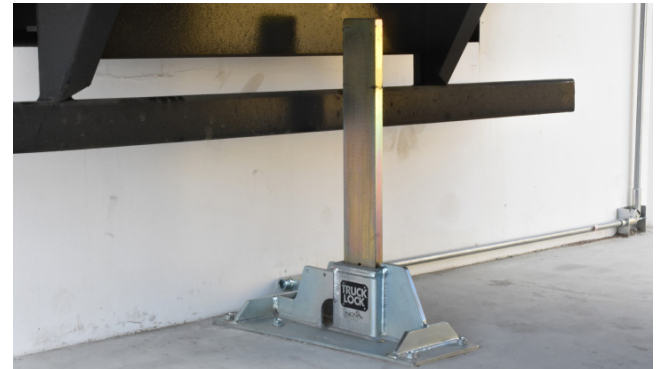
Truck Lock™ 350 Series – Flange Style

FEWEST MOVING PARTS: Truck Locks™ are extremely low maintenance, requiring preventive service once or twice per year