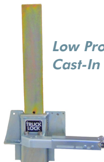
Low Profile Cast-In Style

LONGEST WARRANTY: Truck Locks™ include a lifetime warranty – the longest in the industry!